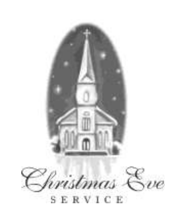
Candlelight Service 7PM