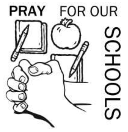
Carroll and Delphi School Begins August 8th