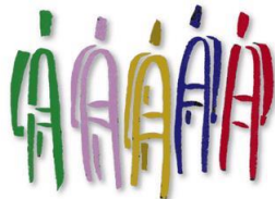
Presbyterian Church Gathering

The six Presbyterian churches will gather at our church in Flora for the next collaborative ministry planning meeting. As hosts, we are providing the meal. This is an opportunity to meet other Presbyterians from around the county and plan events and projects to work on together. Please join us.